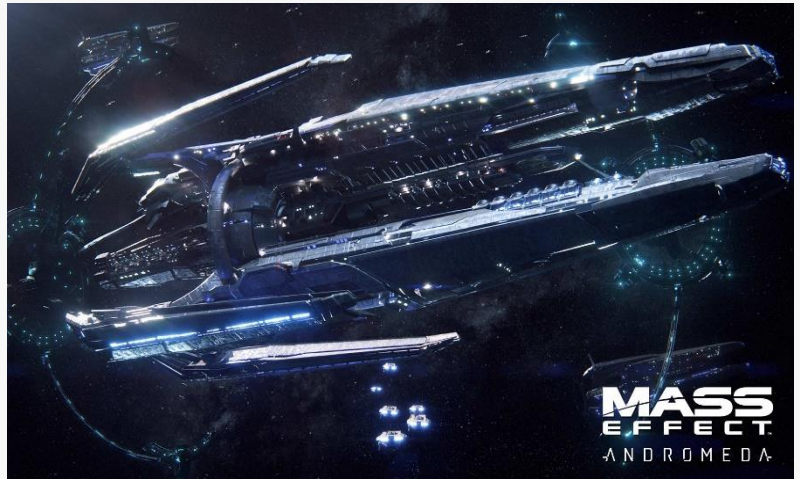
Picture from: Arts, Electronic. "Mass Effect: Andromeda News – Official Site." Masseffect.com. N.p., 06 Apr. 2017. Web. 25 Apr. 2017.

When the game finished downloading, I jumped right into the game. At the beginning, there was a lot of dialogue and cutscenes. It felt boring to me, and that was after an hour of gameplay. The next day I played some more, and got really immersed. There was so much to do, whether it was a side quest, or pursuing a relationship with one of your teammates.